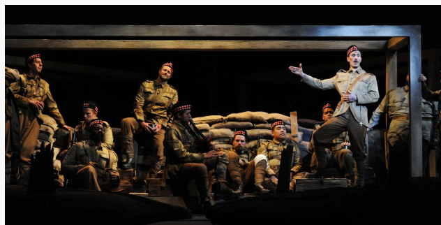
The Scots Platoon.

Though the opera premiered in 2011 (and won the Pulitzer Prize in 2012), Composer Kevin Puts has created a stirring musical score that is a throwback to more mellifluous times. True, there are strong dissonances throughout reflecting the chaos of battle, and excellent use of musical onomatopoeia in