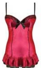
Mother’s Day Hot Lingerie & Sleepwear Gifts – Mother’s Day Lingerie & Sleepwear Gift Guide 2011