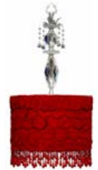
Home & Garden Gift Guide - Home 2011