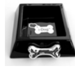
Pet Gifts Guide 2011

Sports Gifts – Sporting Gift Guide for 2011