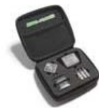
Mother’s Day Vehicle Gifts – Mother’s Day Vehicle Gift Guide