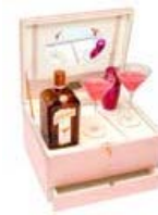
Mother’s Day Food & Beverage Gifts – Mother’s Day Food & Beverage Gift Guide 2011 Over $15